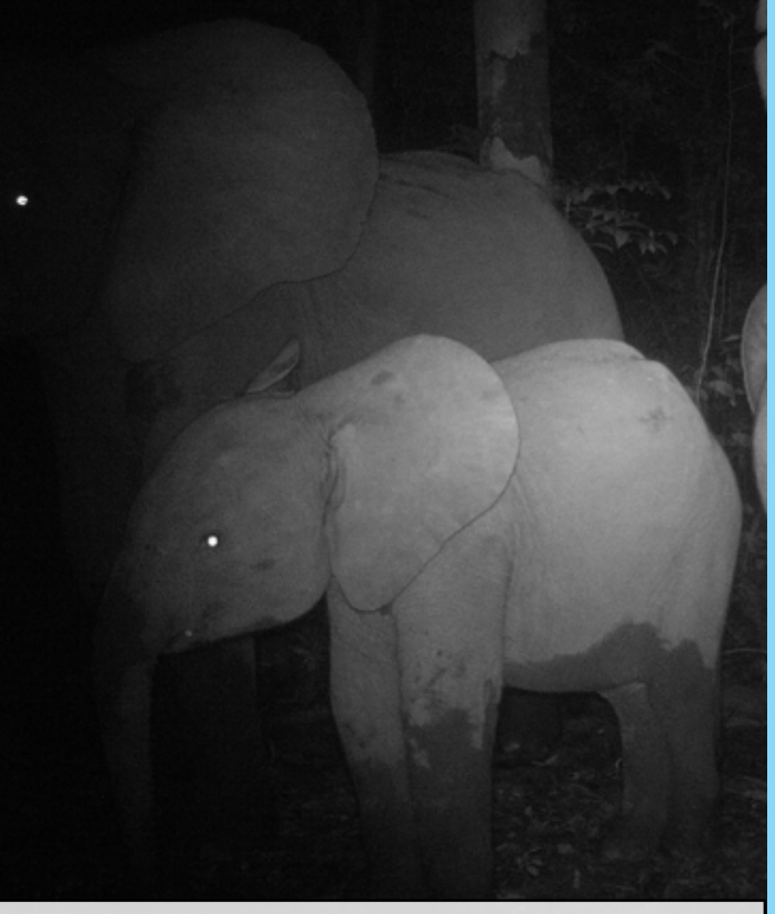
A family of curious African forest elephants encounter Sapo camera traps for the first time

International (FFI), the Forestry Development Authority, the University of Liberia, the Zoological Society of London, the University of Cambridge and the community of Jalays Town to develop a Centre of Excellence for Ecological Research and Conservation