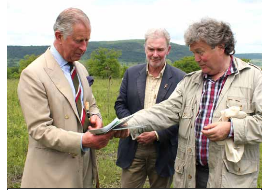
Fundatia ADEPT John Akeroyd presenting HRH Prince Charles with DI guides to the flora and lepitoptera of the Tarnava Mare

with remarkable faunistic and floristic diversity. Identified species, all threatened and protected at European level but still having stable populations in the area, include 10 flora species, 23 mammal species, including wolf, bear, wild cat, otter, water shrew, fat dormouse, common dormouse and several bat species, 55 bird species, including the lesser-spotted eagle, honey-buzzard, sparrow-hawk, goshawk and corncrake, and at least 6 lepidoptera species including Scarce Fritillary, Scarce Large Blue,