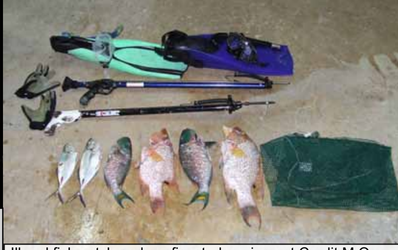
Illegal fish catch and confiscated equipment