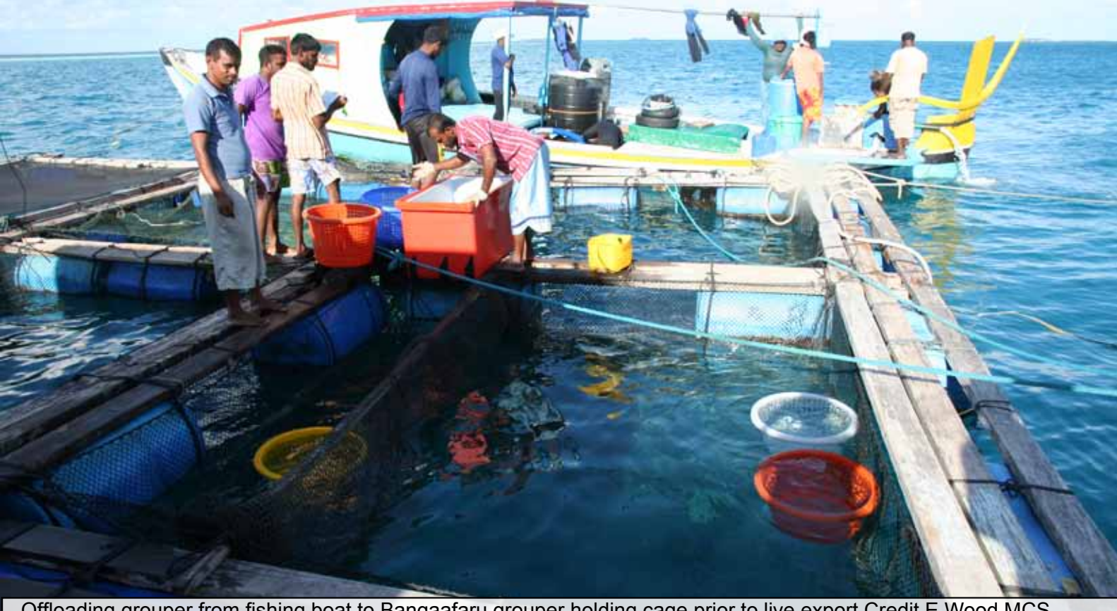
Offloading grouper from fishing boat to Bangaafaru grouper holding cage prior to live export

to ensure that the reef fisheries are managed and sustainable. Currently our main focus is on the high-value grouper fishery, which provides chilled and live fish for export. Commercial fishing for grouper in the Maldives began in the early 1990s in response to demand from international markets, particularly in the Far East. Data analysis by the Marine Research Centre shows that in 2010 exports were worth over 40 million rufiyaa (= £2 million GBP) and consisted of around 450,000 tonnes of fresh/ chilled grouper and 125,000 live groupers.