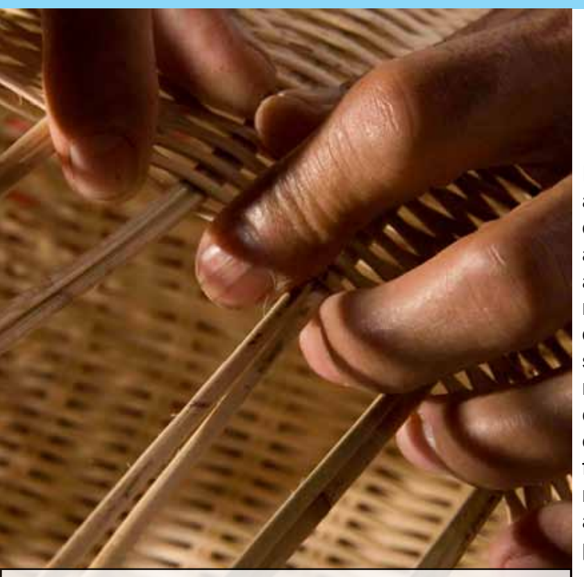
Basket making women from Ulu Papar are skilled in this craft using forest resources.

sized fragments, LGRs support ~ 20% of the species richness of HGRs. We conclude that forest restoration and rehabilitation of LGR plantation fragments to achieve similarly high habitat quality to HGRs may increase LGR effectiveness as reservoirs of biodiversity within plantations.