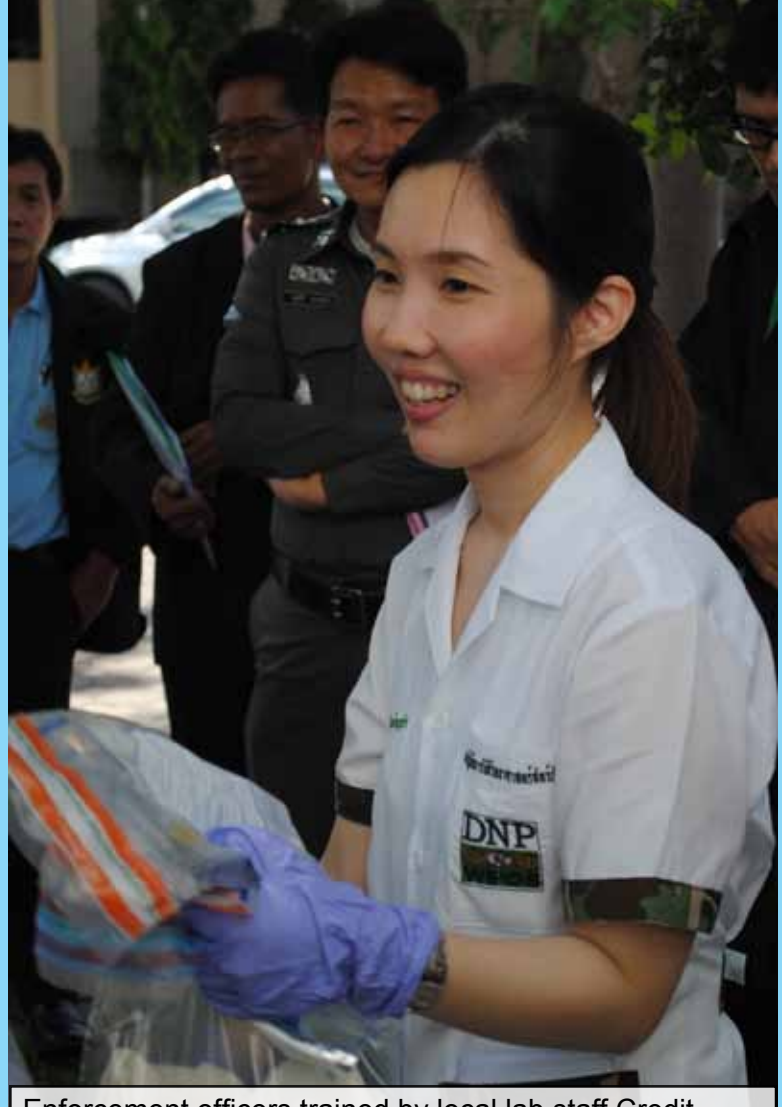
Enforcement officers trained by local lab staff

The project has been led by TRACE Wildlife Forensics Network, in partnership with TRAFFIC South East Asia. "Using local capacity to lead the enforcement officer training was key to its success" stated TRACE